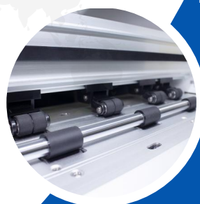
Double-Row Paper Wheel