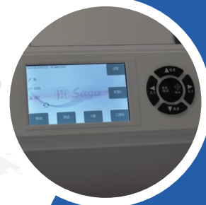
4.3 inch capacitive touch screen