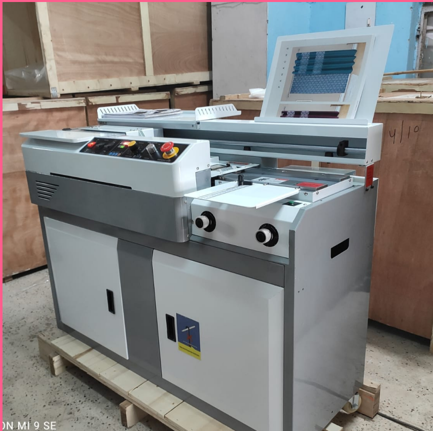
ON MI 9 SE