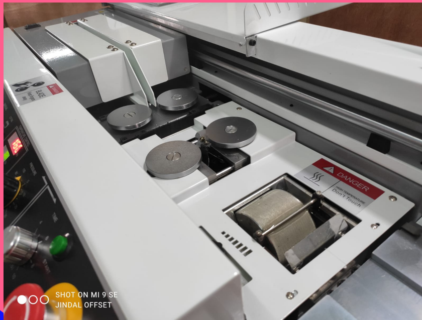
SHOT ON MI 9 SE JINDAL OFFSET