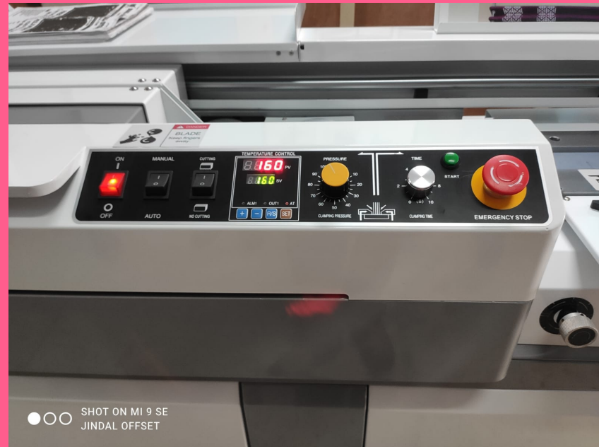
SHOT ON MI 9 SE JINDAL OFFSET