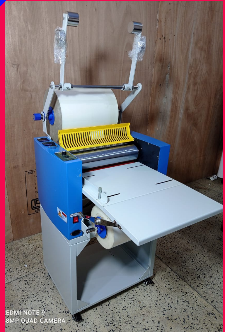
EDMI NOTE 9 8MP QUAD CAMERA