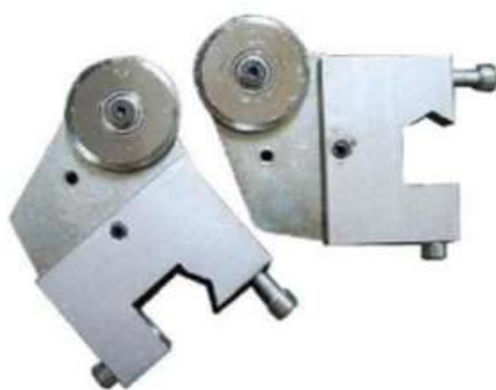
Half cutting Knife